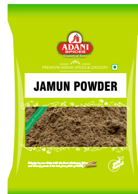
Jamun Powder 20 x 100g