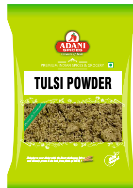
Tulsi Powder 20 x 100g