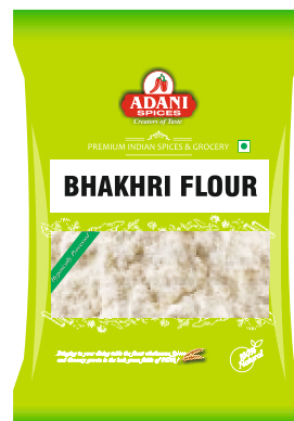
Bhakhari Flour 20 x 800g | 10 x 4lbs 5 x 8lbs