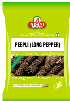
Peepli (Long Pepper) 20 x 100g