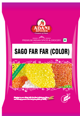
Sago Far Far (Color) 10 x 400g