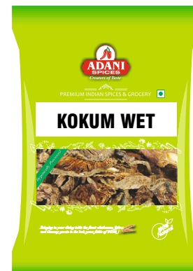
Kokum Wet 20 x 200g