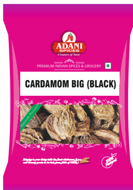
Cardamom Big (Black) 20 x 100g