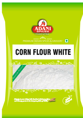
Corn Flour (White) 20 x 400g | 10 x 800g 5 x 4lbs