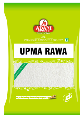
Madrasi Upma Rawa 20 x 2lbs | 10 x 4lbs