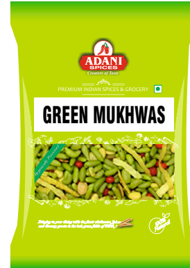
Green Mukhwas 20 x 200g | 20 x 400g