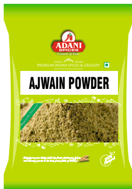
Ajwain Powder 20 x 125g