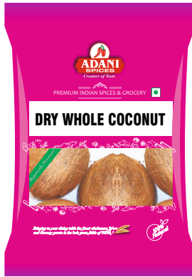
Dry Whole Coconut 20 x 1pc | 20 x 2pc