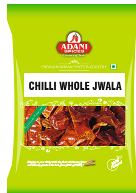
Chilli Whole Jwala 20 x 100g