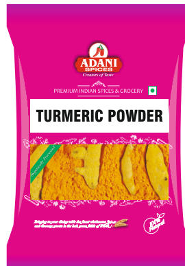
Turmeric Powder 20 x 200g | 200 x 400g 10 x 800g | 5 x 4lbs