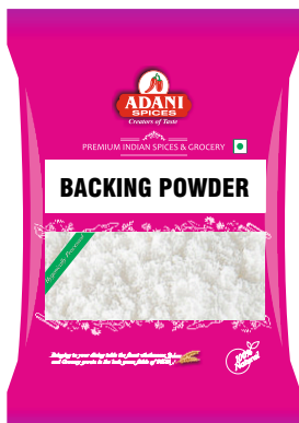
Baking Powder 20 x 100g