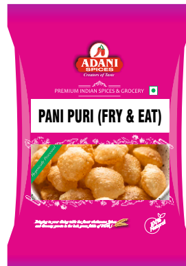
Pani Puri (Fry & Eat) 20 x 200g