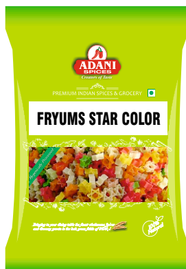
Fryums Star Color 20 x 400g