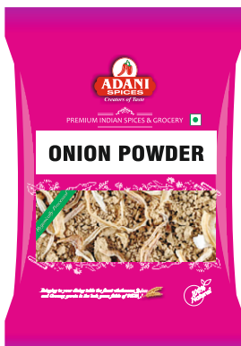
Onion Powder 20 x 200g