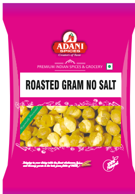
Roasted Gram No Salt 20 x 200g | 20 x 400g