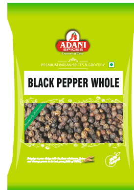
Black Pepper Whole 20 x 100g | 20 x 200g 20 x 400g | 5 x 2lbs