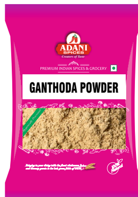
Ganthoda Powder 20 x 100g