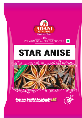
Star Anise Seed 20 x 100g | 20 x 200g 20 x 400g