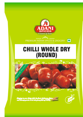
Chilli Whole Dry (Round) 20 x 100g | 20 x 200g