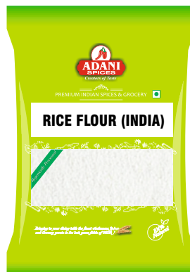
Rice Flour (India) 20 x 800g | 10 x 4lbs 5 x 8lbs