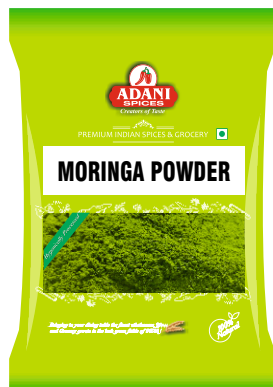
Moringa Powder 20 x 100g | 20 x 200g