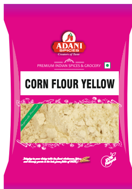
Corn Flour (Yellow) 20 x 400g | 10 x 800g 5 x 4lbs