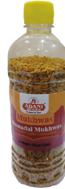
Dhanadal Mukhwas 12 x 250g