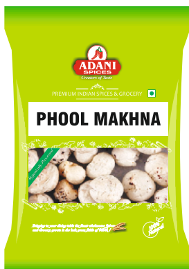
Phool Makhana 20 x 50g | 20 x 100g 20 x 200g | 20 x 400g