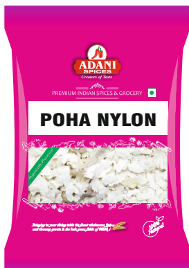
Poha Nylon 20 x 400g | 10 x 800g