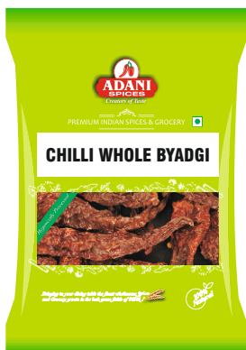
Chilli Whole Byadgi 20 x 100g | 20 x 200g 10 x 400g