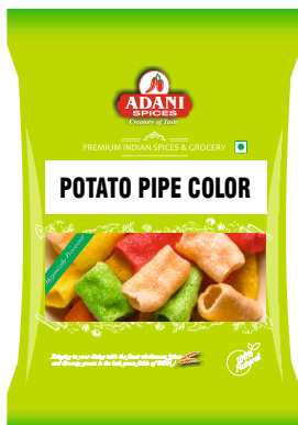
Potato Pipe Color 20 x 400g