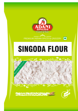
Singoda Flour 20 x 400g