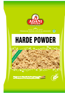
Harde Powder 20 x 125g