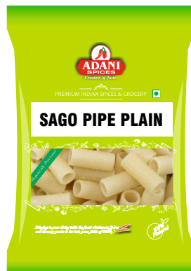
Sago Pipe Plain 20 x 400g