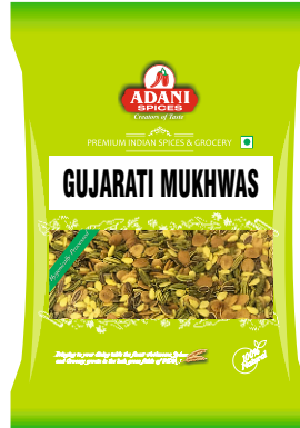
Gujarati Mukhwas 20 x 200g | 20 x 400g