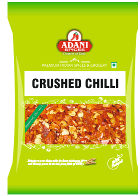
Crushed Chilli 20 x 100g | 20 x 200g 5 x 4lbs