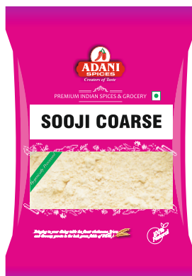
Sooji (Coarse) 20 x 800g | 10 x 4lbs 5 x 8lbs