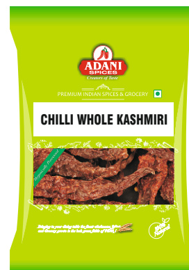
Chilli Whole Kashmiri 20 x 100g | 20 x 200g