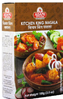
Adani Kitchen King Masala 10 x 100g