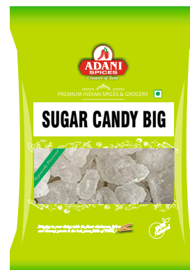
Sugar Candy Big (Whole) 20 x 200g | 20 x 400g