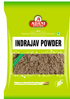
Indrajav Powder 20 x 100g