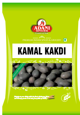
Kamal Kakdi 20 x 100g