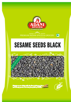
Sesame Seed Black 20 x 200g | 20 x 400g