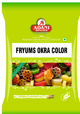
Fryums Okra Color 20 x 400g