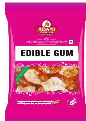
Edible Gum 20 x 100g | 20 x 200g 20 x 400g