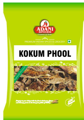
Kokum Phool 20 x 200g