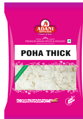
Poha Thick 20 x 400g | 20 x 800g 10 x 4lbs