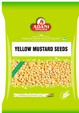
Yellow Mustard Seeds 20 x 200g | 20 x 400g