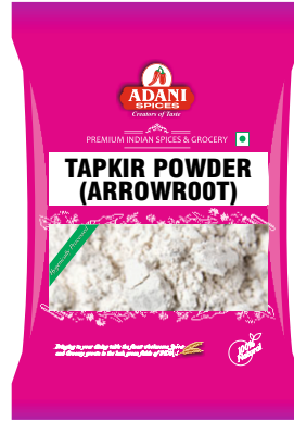
Tapkir Powder (Arrowroot) 20 x 200g | 20 x 400g