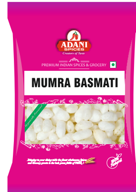
Mumra Basmati 20 x 400g | 10 x 2lbs 4 x 5lbs