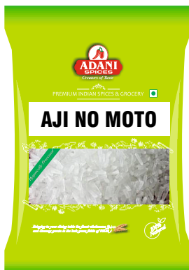
Aji No Moto 20 x 100g | 20 x 200g