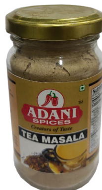
Tea Masala (Glass Jar) 20 x 100g