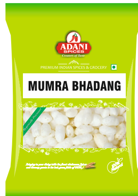
Mumra Bhadang 20 x 400g | 10 x 2lbs 4 x 5lbs