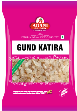
Gund Katira 20 x 200g