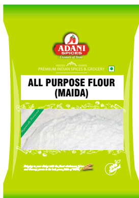
All Purpose Flour (Maida) 20 x 400g | 20 x 800g 10 x 4lbs