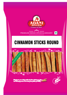
Cinnamon Sticks Round 20 x 100g | 20 x 200g 20 x 400g