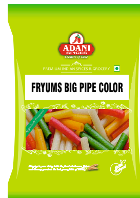
Fryums Pipe Big Color 20 x 400g