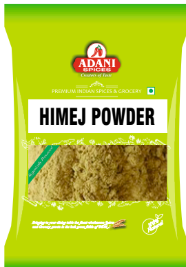
Himej Powder 20 x 100g