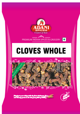
Cloves Whole 20 x 100g | 20 x 200g 5 x 4lbs