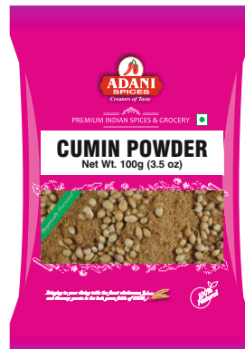
Cumin Powder 20 x 200g | 20 x 400g 10 x 800g | 5 x 4lbs