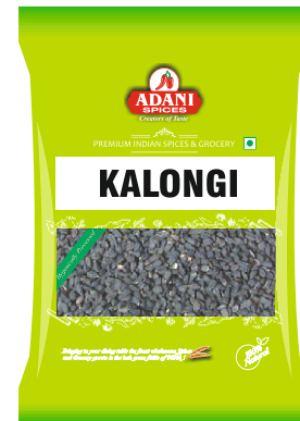
Kalonji 20 x 100g | 20 x 200g