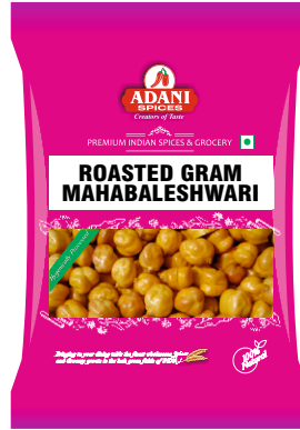
Roasted Gram Mahabaleshwari 20 x 200g | 20 x 400g