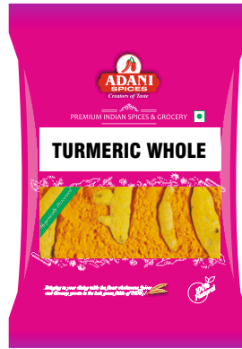
Turmeric Whole 20 x 100g | 20 x 200g