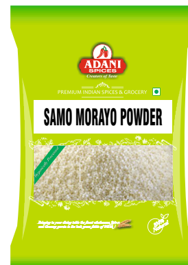
Samo Morayo Powder 20 x 400g