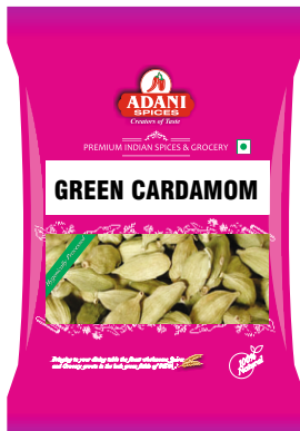
Green Cardamom 20 x 100g | 20 x 200g 20 x 400g