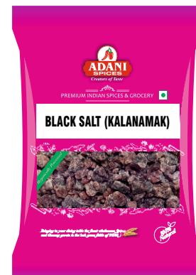
Black Salt (Kala Namak) 20 x 100g | 20 x 200g 20 x 400g | 5 x 2lbs