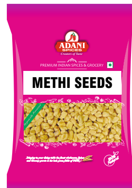
Methi Seeds 20 x 200g | 20 x 400g 10 x 800g | 5 x 4lbs