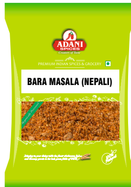
Bara Masala (Nepali) 20 x 200g