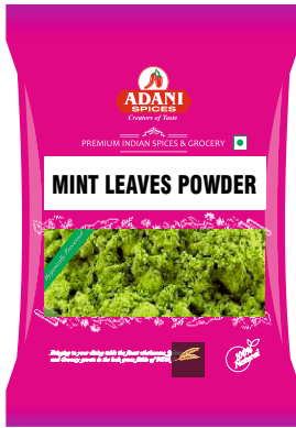
Mint Leaves Powder 20 x 200g