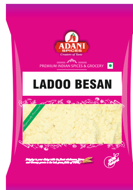
Ladoo Besan 20 x 2lbs | 10 x 4lbs