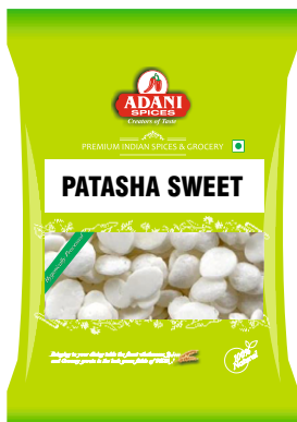
Patasha Sweet 20 x 200g