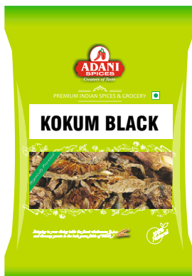
Kokum Black 20 x 200g