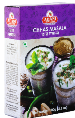
Adani Chhas Masala 10 x 100g