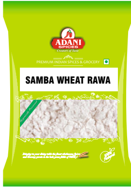
Samba Wheat Rawa 20 x 2lbs