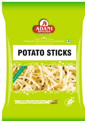
Potato Sticks 20 x 200g