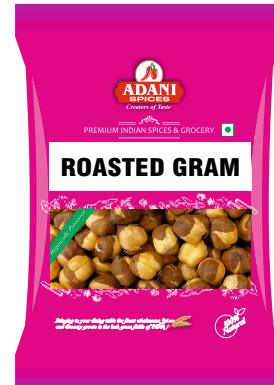
Roasted Gram 20 x 200g | 20 x 400g 20 x 800g | 10 x 4lbs