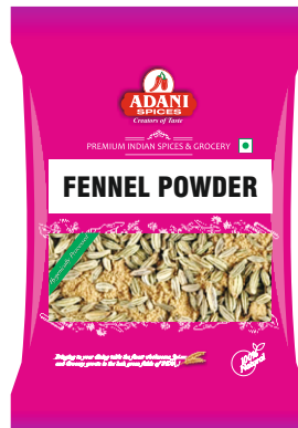
Fennel Powder 20 x 200g