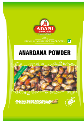
Anardana Powder 20 x 100g