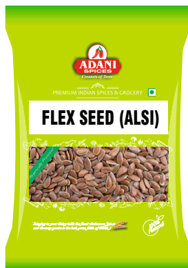
Flex Seed (Alsi) 20 x 200g | 20 x 400g