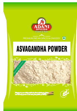
Asvagandha Powder 20 x 100g