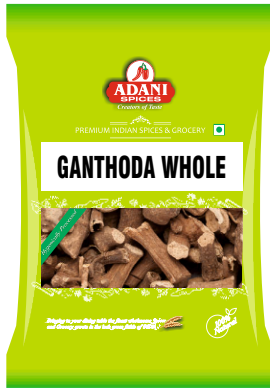
Ganthoda Whole 20 x 100g