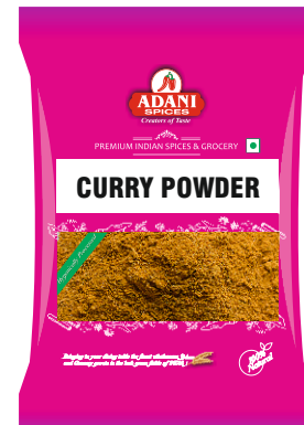
Curry Powder 20 x 200g | 20 x 400g