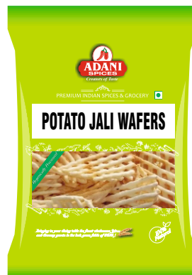
Potato Jali Wafers 10 x 400g