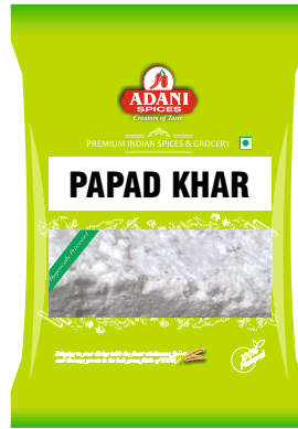
Papad Khar 20 x 200g | 20 x 400g