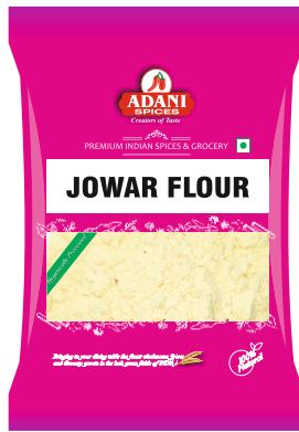
Jowar Flour (Dadar Goti) 10 x 800g | 5 x 8lbs