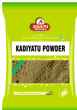
Kadiyatu Powder 20 x 100g