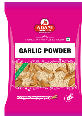
Garlic Powder 20 x 200g