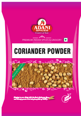
Coriander Powder 20 x 200g | 20 x 400g 10 x 800g | 5 x 4lbs