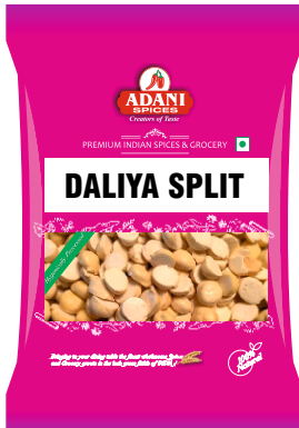
Daliya Split 20 x 200g | 20 x 400g 20 x 800g | 10 x 4lbs