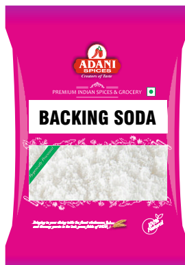
Baking Soda 20 x 150g