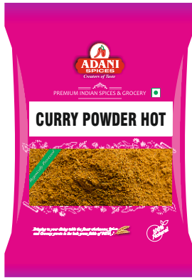
Curry Powder Hot 20 x 200g | 20 x 400g