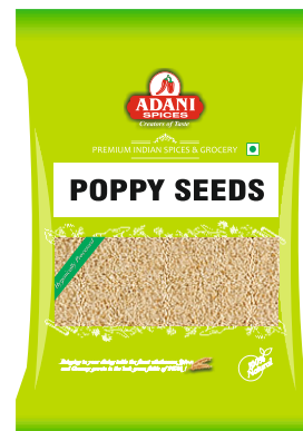
Poppy Seeds 20 x 100g | 20 x 200g 20 x 400g