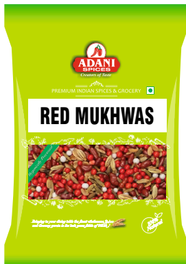
Red Mukhwas 20 x 200g | 20 x 400g