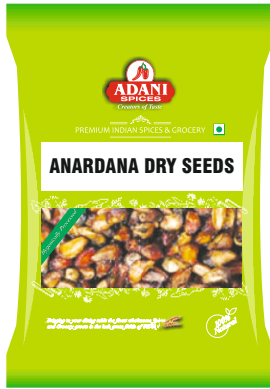
Anardana Dry Seeds (Dry Pomegranate Seed) 20 x 100g