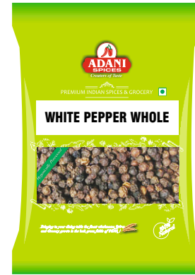
White Pepper Whole 20 x 100g