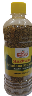
Suva Dana Mukhwas 12 x 250g