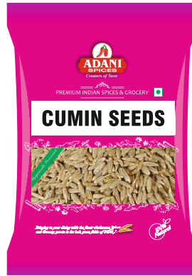
Cumin Seeds 20 x 100g | 20 x 200g | 20 x 400g 10 x 800g | 5 x 4lbs