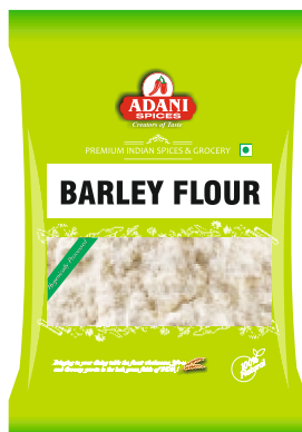
Barley Flour 20 x 800g | 10 x 4lbs