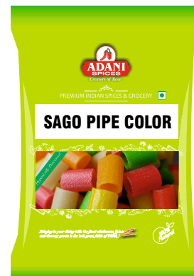
Sago Pipe Color 20 x 400g