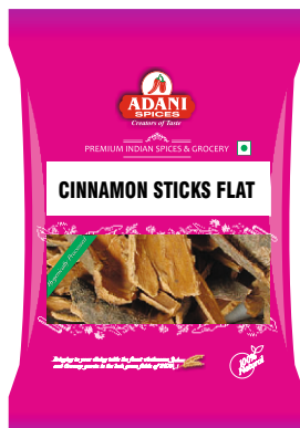
Cinnamon Sticks Flat 20 x 100g | 20 x 200g 20 x 400g