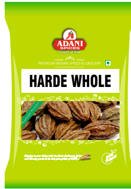
Harde Whole 20 x 100g