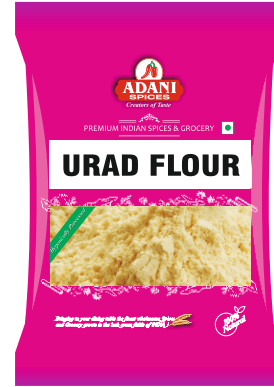
Urad Flour 10 x 800g