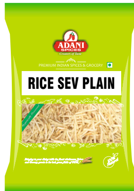
Rice Sev plain 20 x 200g