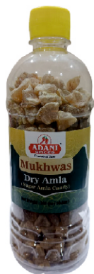
Dry Amla Mukhwas 12 x 250g