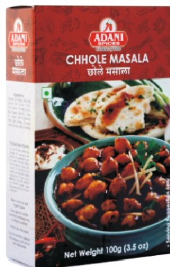
Adani Chhole Masala 10 x 100g