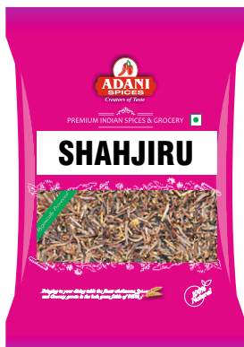
Shahjiru 20 x 100g | 20 x 200g 20 x 400g