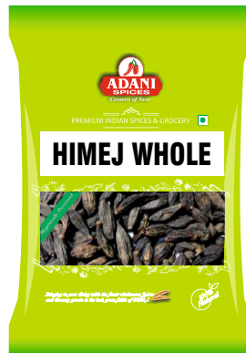
Himej Whole 20 x 100g