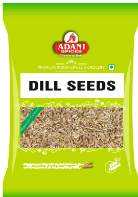
Dill Seds (Suwa) 20 x 100g | 20 x 200g