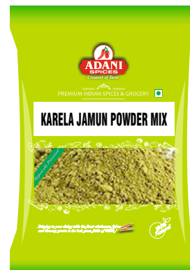
Karela & Jamon Powder Mix 20 x 125g