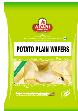
Potato Plain Wafers 10 x 400g