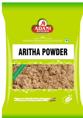
Aritha Powder 20 x 100g