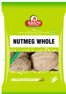
Nutmeg Whole 20 x 100g | 20 x 200g