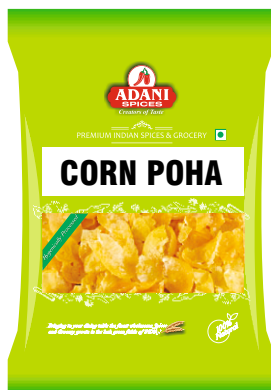
Corn Poha 20 x 200g | 10 x 400g