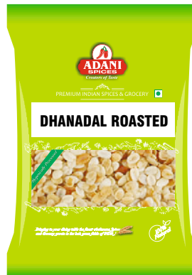
Dhanadal Roasted 20 x 200g | 20 x 400g 10 x 800g | 5 x 4lbs