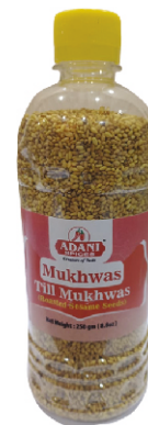
Till Mukhwas 12 x 250g