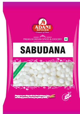
Sabudana 20 x 200g | 20 x 400g 20 x 800g | 10 x 4lbs