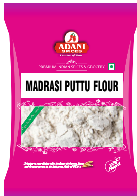
Madrasi Puttu Flour 20 x 2lbs