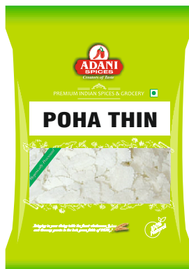
Poha Thin 20 x 400g | 20 x 800g 10 x 4lbs