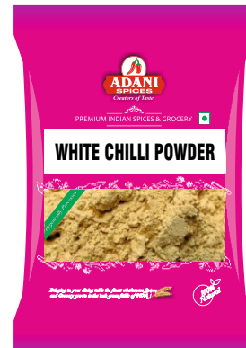
White Chilli Powder 20 x 100g