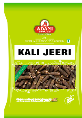
Kali Jeeri 20 x 125g