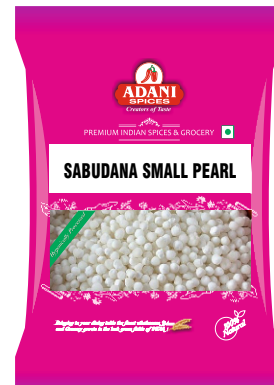
Sabudana Small Pearl 20 x 800g