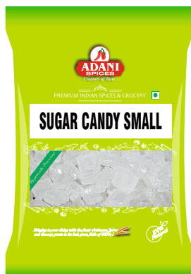
Sugar Candy (Small) 20 x 100g | 20 x 200g | 20 x 400g 20 x 800g | 10 x 4lbs