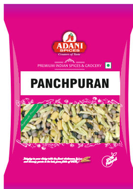
Panchpuran 20 x 100g | 20 x 200g