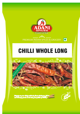
Chilli Whole Long 20 x 100g | 20 x 200g