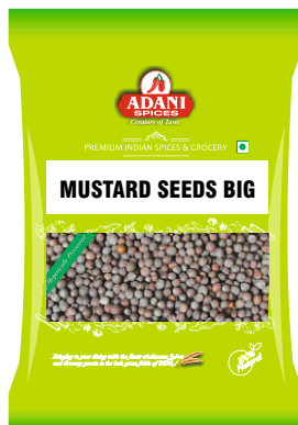
Mustard Seeds (Big) 20 x 200g | 20 x 400g 10 x 800g