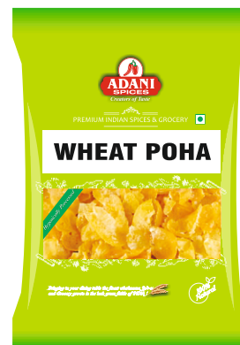
Wheat Poha 20 x 400g | 10 x 800g