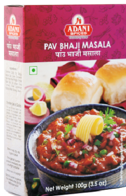
Adani Pav Bhaji Masala 10 x 100g