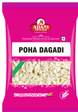
Poha Dagadi 20 x 400g | 20 x 800g 10 x 4lbs