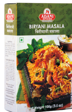
Adani Biryani Masala 10 x 100g