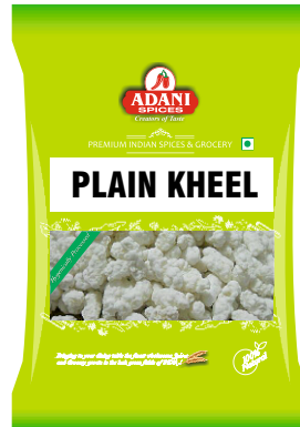
Plain Kheel 20 x 200g