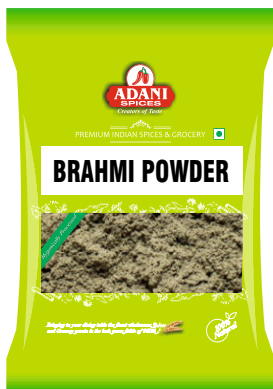
Brahmi Powder 20 x 100g