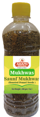
Saunf (Variyali) Mukhwas 12 x 200g