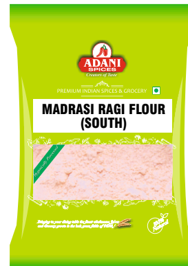
Madrasi Ragi Flour (South) 20 x 2lbs | 10 x 4lbs