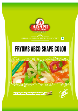
Fryums ABCD Shape Color 20 x 400g