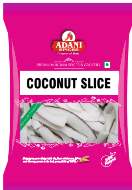
Coconut Slice 20 x 200g | 20 x 400g