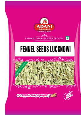
Fennel Seeds Lucknowi 20 x 200g | 20 x 400g