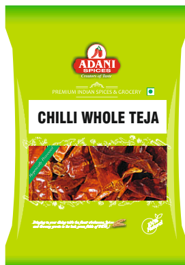
Chilli Whole Teja 20 x 100g