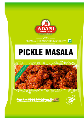
Pickle Masala 20 x 200g