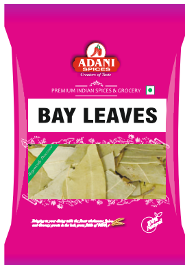
Bay Leaves 20 x 25g | 20 x 50g 20 x 100g | 5 x 2lbs