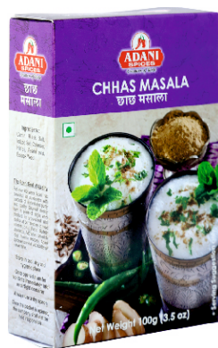
Chhas Masala 10 x 100g