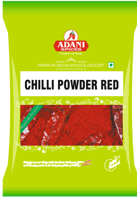
Chilli Powder 20 x 200g | 20 x 400g 10 x 800g | 5 x 4lbs