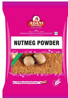
Nutmeg Powder 20 x 100g