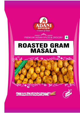
Roasted Gram Masala 20 x 200g | 20 x 400g