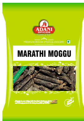
Marathi Moggu 20 x 100g