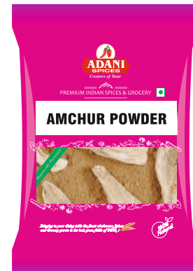
Amchur Powder 20 x 100g | 20 x 200g 20 x 400g | 5 x 2lbs