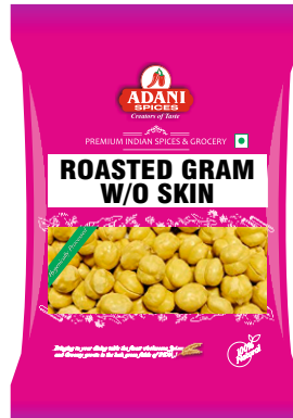
Roasted Gram (W/O Skin) 20 x 200g | 20 x 400g