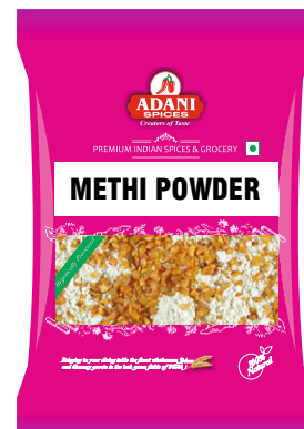
Methi Powder 20 x 200g