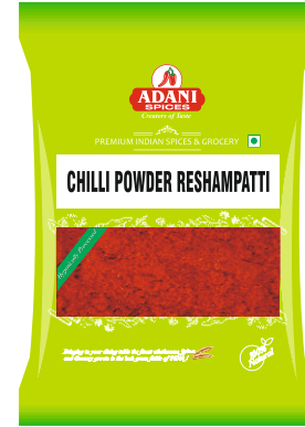
Chilli Powder Reshampatti 20 x 200g | 20 x 400g