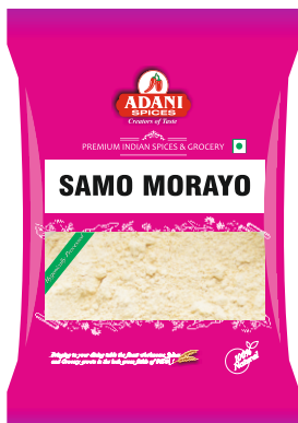
Samo Morayo 20 x 400g | 20 x 800g