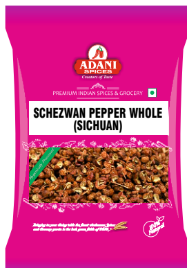
Schezwan Pepper Whole (Sichuan) 20 x 50g