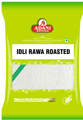
Idli Rawa Roasted 20 x 2lbs | 10 x 4lbs