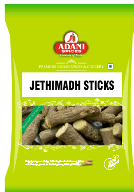
Jethimadh Sticks 20 x 50g