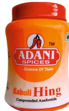
Adani Hing 20 x 100g