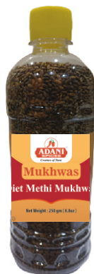
Diet Methi Mukhwas 12 x 190g