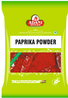
Paprika Powder 20 x 200g | 200 x 400g 5 x 4lbs