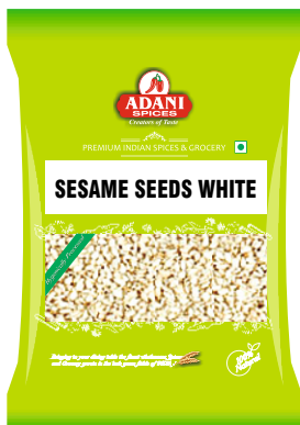
Sesame Seed White 20 x 200g | 20 x 400g 10 x 800g | 5 x 4lbs