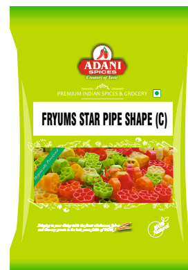
Fryums Star Pipe Shape (C) 20 x 400g