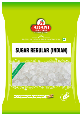
Sugar Regular (Indian Sugar) 20 x 400g | 20 x 800g 10 x 4lbs