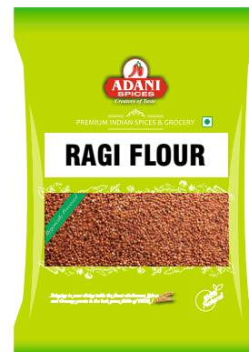
Ragi Flour 20 x 800g