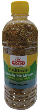
Ajwain Mukhwas 12 x 250g