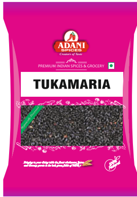
Tukamaria 20 x 100g | 20 x 200g