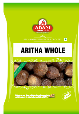
Aritha Whole 20 x 100g