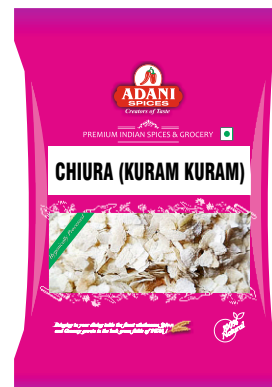
Chiura (Kuram Kuram) 20 x 800g