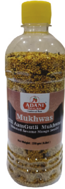
Till Gotti Mukhwas 12 x 250g