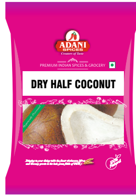
Dry Half Coconut 20 x 200g | 20 x 400g