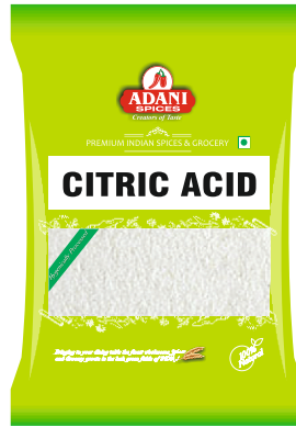
Citric Acid 20 x 100g