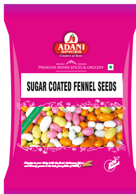
Sugar Coated Fennel Seed 20 x 200g | 20 x 400g 20 x 800g | 10 x 4lbs