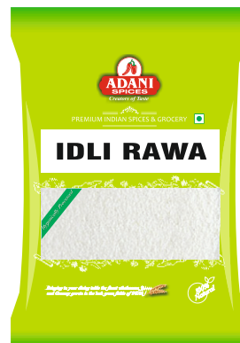
Idli Rawa 20 x 800g | 10 x 4lbs 5 x 8lbs