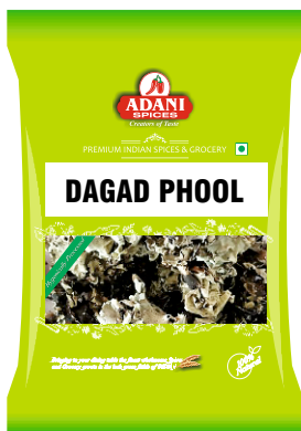
Dagal Phool 20 x 50g