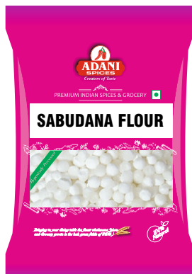
Sabudana Flour 20 x 400g