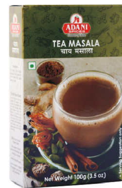
Tea Masala (Box) 10 x 100g