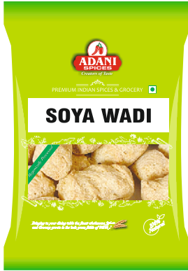
Soya Wadi 20 x 400g