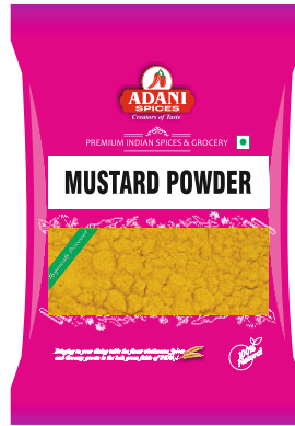
Mustard Powder 20 x 100g | 20 x 200g