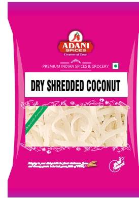
Dry Shredded Coconut 20 x 200g | 20 x 400g