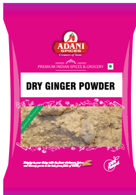
Dry Ginger Powder 20 x 100g | 20 x 200g