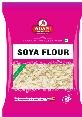
Soya Flour 20 x 400g | 10 x 800g