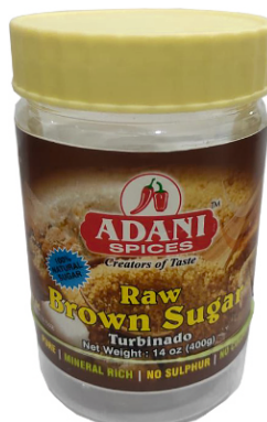
Raw Brown Sugar (JAR) 20 x 400g