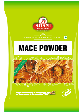
Mace Powder 20 x 100g