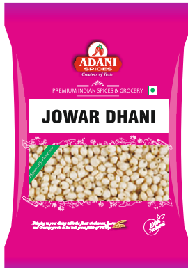
Juwar Dhani 20 x 200g | 10 x 400g