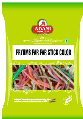
Fryums Far Far Stick Color 20 x 400g