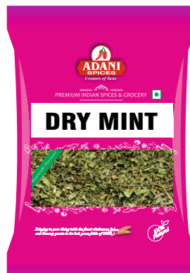
Dry Mint 20 x 50g