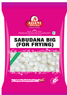
Sabudana Big (For Frying) 20 x 200g | 20 x 400g