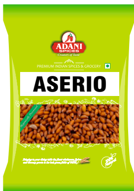
Aserio 20 x 200g