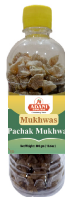
Pachak Mukhwas 12 x 150g