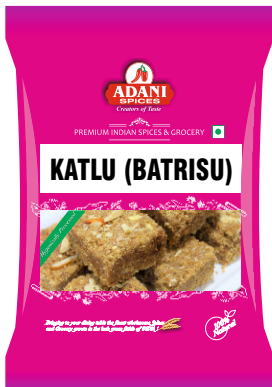
Katlu (Batrisu) 20 x 200g