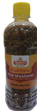
Alsi Mukhwas 12 x 250g