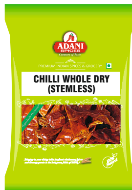
Chilli Whole Dry (Stemless) 20 x 100g | 20 x 200g 10 x 400g