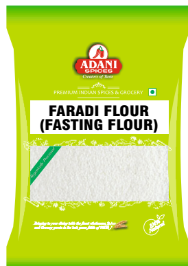
Faradi Flour (Fasting Flour) 10 x 800g