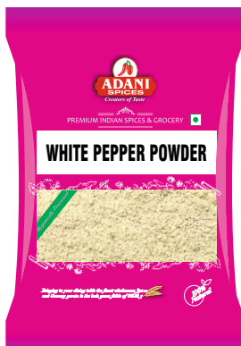
White Pepper Powder 20 x 100g