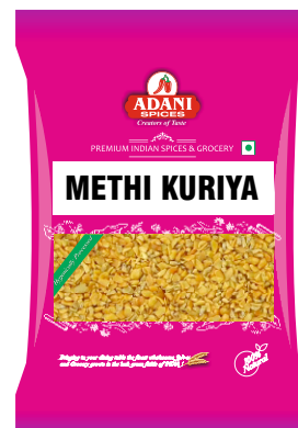
Methi Kuriya 20 x 200g | 20 x 400g