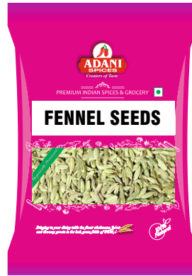
Fennel Seeds 20 x 200g | 20 x 400g 10 x 800g | 5 x 4lbs