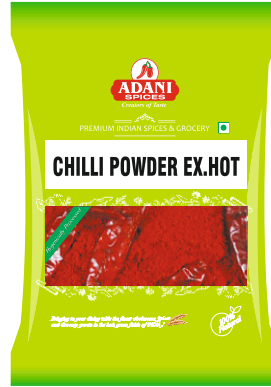
Chilli Powder Ex.Hot 20 x 200g | 20 x 400g 10 x 800g | 5 x 4lbs