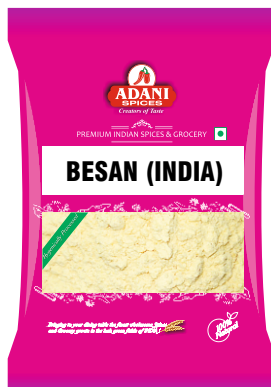
Besan (India) 20 x 2lbs | 10 x 4lbs 5 x 8lbs