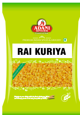
Rai Kuriya 20 x 200g