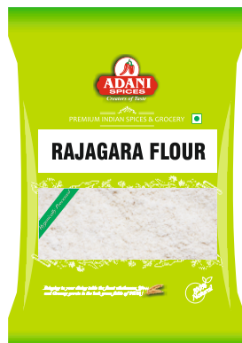
Rajagara Flour 20 x 400g | 20 x 800g