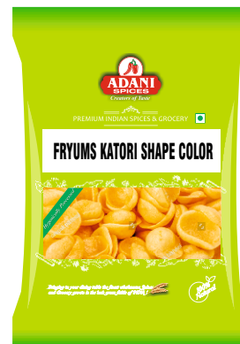
Fryums Katori Shape Color 20 x 400g