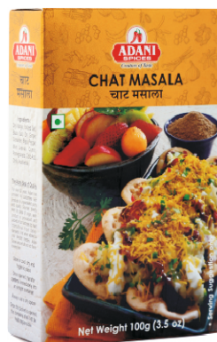
Adani Chat Masala 10 x 100g