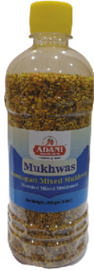
Jamnagari Mix Mukhwas 12 x 250g