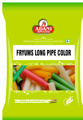
Fryums Long Pipe Color 20 x 400g