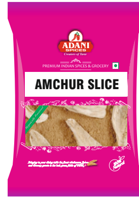
Amchur Slice (Dry Mango Slice) 20 x 200g