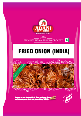
Fried Onion (India) 20 x 400g