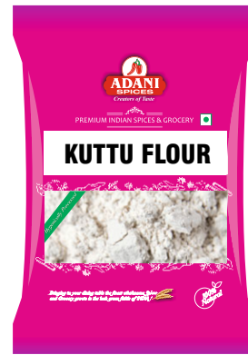
Kuttu Flour 20 x 2lbs