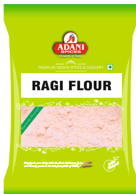
Ragi Flour 20 x 400g | 20 x 800g 10 x 4lbs