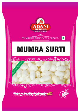
Mumra Surti 20 x 400g | 10 x 2lbs 4 x 5lbs