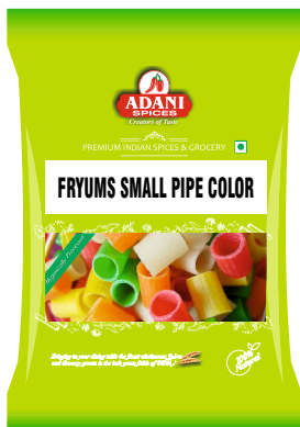
Fryums Small Pipe Color 20 x 400g