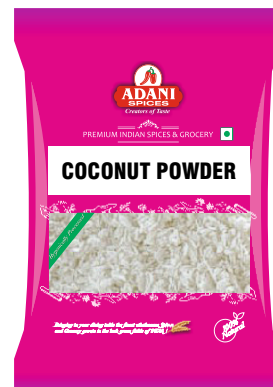
Coconut Powder 20 x 200g | 20 x 400g 10 x 800g