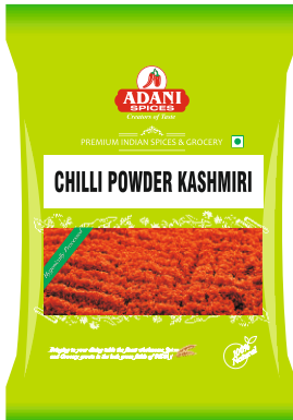
Chilli Powder Kashmiri 20 x 200g | 20 x 400g 10 x 800g | 5 x 4lbs