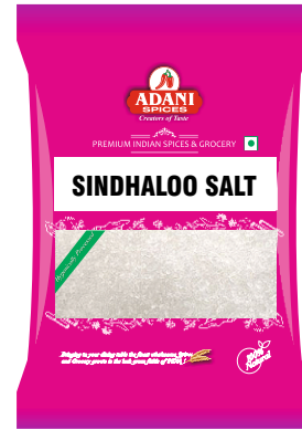
Sindhhaloo Salt 20 x 200g | 20 x 400g