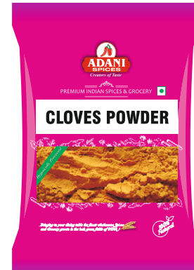
Cloves Powder 20 x 100g