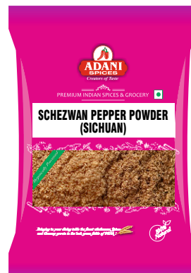
Schezwan Pepper Powder (Sichuan) 20 x 50g