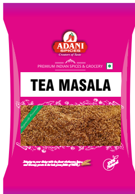
Tea Masala 20 x 100g | 20 x 200g