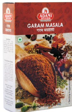
Adani Garam Masala 10 x 100g