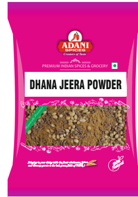
Dhana Jeera Powder 20 x 200g | 20 x 400g 10 x 800g | 5 x 4lbs