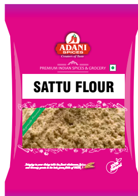
Sattu Flour 20 x 2lbs