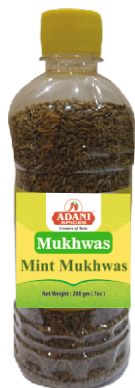
Mint Mukhwas 12 x 190g