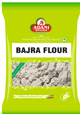
Bajri Flour 20 x 800g | 10 x 4lbs