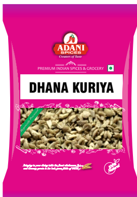
Dhana Kuriya 20 x 200g