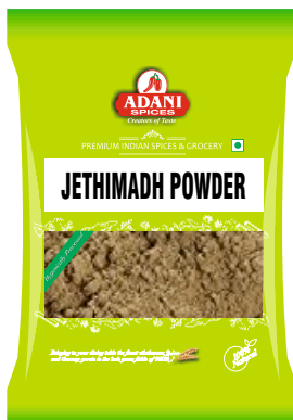
Jethimadh Powder 20 x 100g