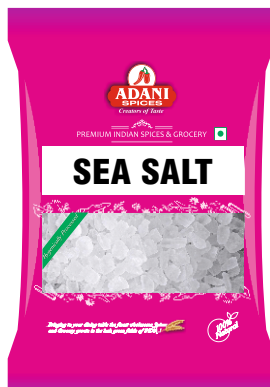
Sea Salt 12 x 2lbs