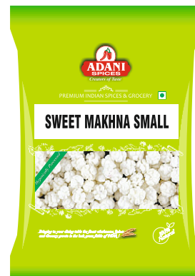
Sweet Makhna Small 20 x 200g | 20 x 400g