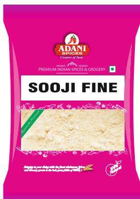
Sooji (Fine) 20 x 800g | 10 x 4lbs