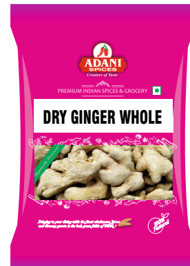
Dry Ginger Whole 20 x 100g | 20 x 200g