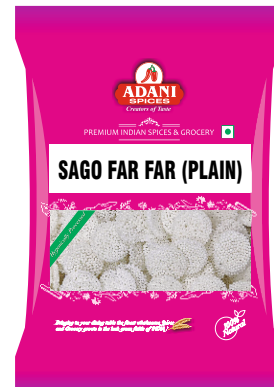
Sago Far Far (Plain) 10 x 400g