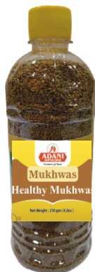
Healthy Mukhwas 12 x 150g