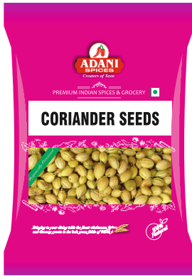
Coriander Seeds 20 x 100g | 20 x 200g | 20 x 400g 10 x 800g | 5 x 4lbs