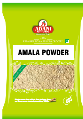
Amala Powder 20 x 100g