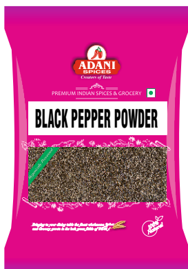
Black Pepper Powder 20 x 100g