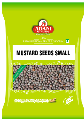
Mustard Seeds (Small) 20 x 100g | 20 x 200g | 20 x 400g 10 x 800g | 5 x 4lbs