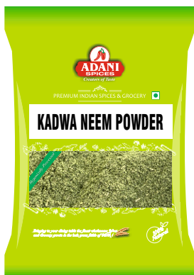
Kardva Neem Powder 20 x 100g