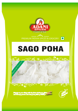
Sago Poha 20 x 200g