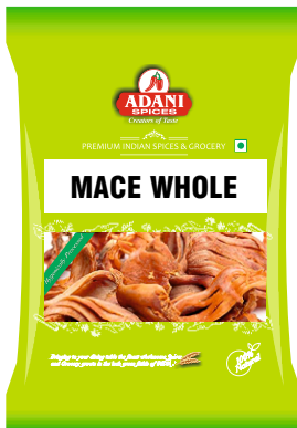
Mace Whole 20 x 100g