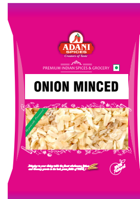
Onion Minced 20 x 200g