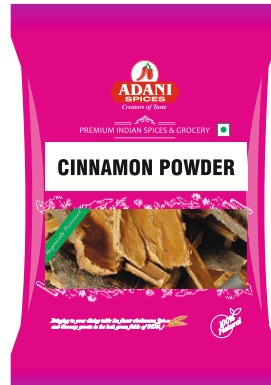
Cinnamon Powder 20 x 100g