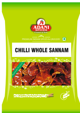
Chilli Whole Sannam 20 x 100g