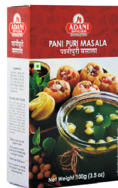
Adani Pani Puri Masala 10 x 100g