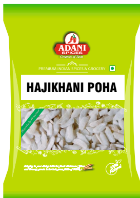
Hajikhani Poha 20 x 400g | 20 x 800g