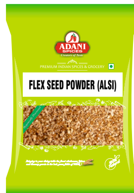
Flex Seed Powder (Alsi) 20 x 200g | 20 x 400g