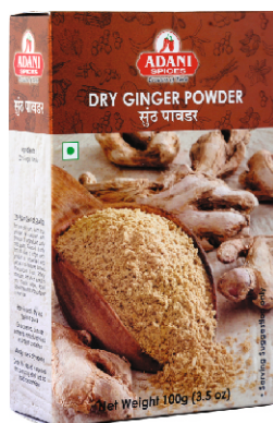
Adani Dry Ginger Powder 10 x 100g