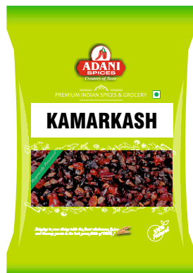
Kamarkash 20 x 100g