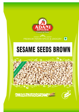
Sesame Seed Brown 20 x 200g | 20 x 400g 10 x 800g | 5 x 4lbs