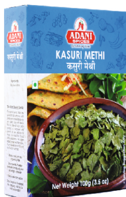
Adani Kasuri Methi 10 x 100g