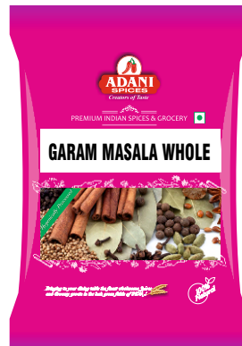
Garam Masala Whole 20 x 200g | 20 x 400g