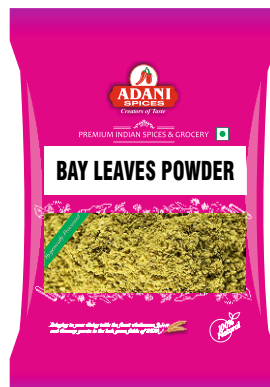
Bay Leaves Powder 20 x 200g