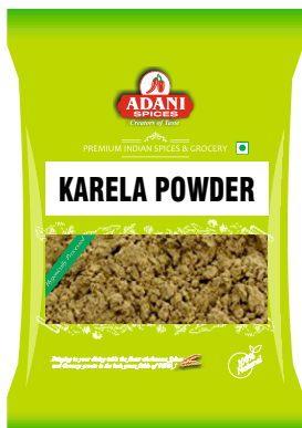
Karela Powder 20 x 100g