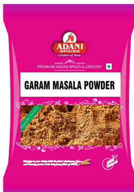
Garam Masala Powder 20 x 100g | 20 x 200g 20 x 400g | 5 x 4lbs