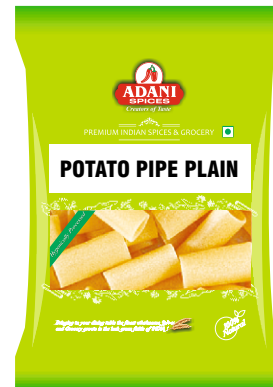
Potato Pipe Plain 20 x 400g