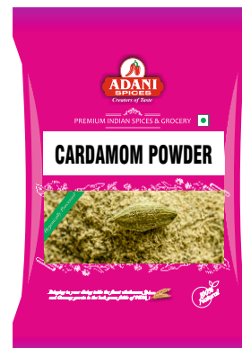
Cardamom Powder 20 x 100g