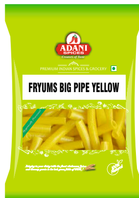
Fryums Pipe Big Yellow 20 x 400g